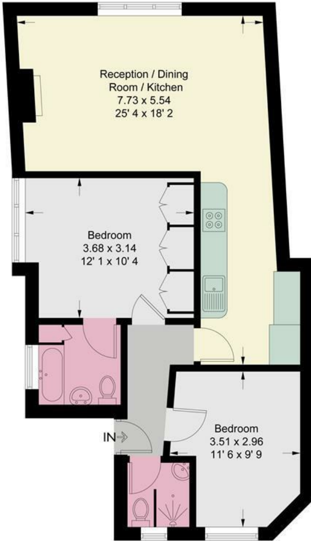
First Floor 648 sq ft / 60.2 sq m