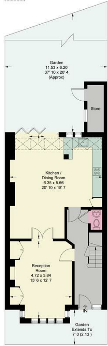
Ground Floor 653 sq ft / 60.7 sq m