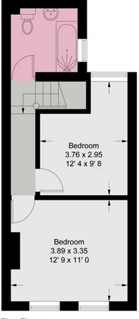
First Floor 359 sq ft / 33.4 sq m