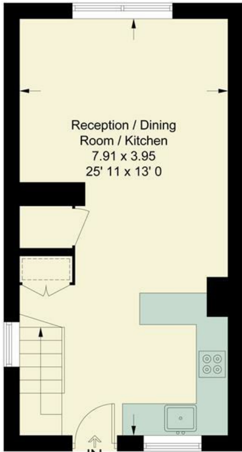
Third Floor 337 sq ft / 31.3 sq m (Including Reduced Headroom)