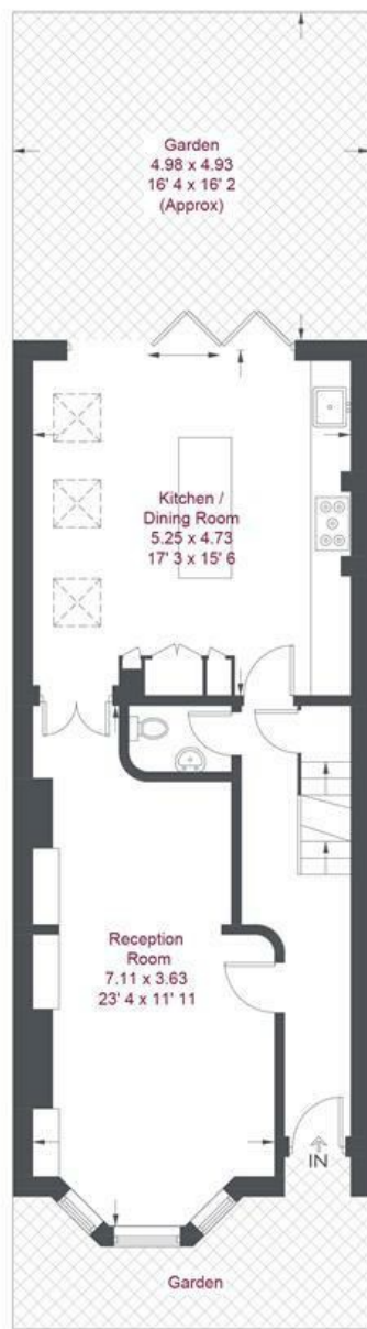
Ground Floor 671 sq ft / 62.3 sq m