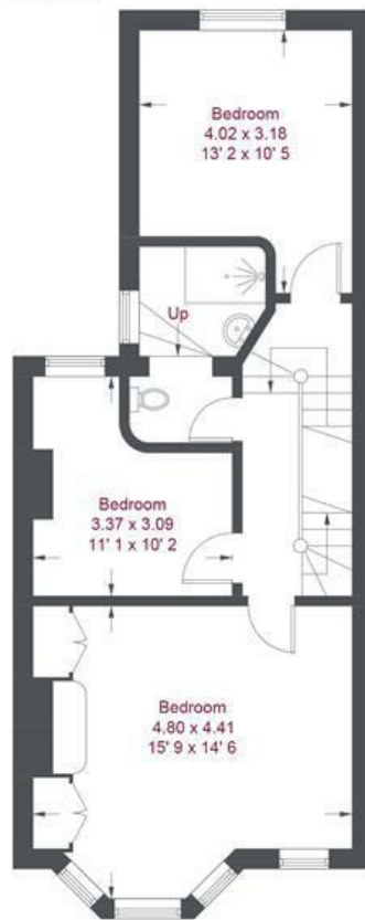
First Floor 579 sq ft / 53.8 sq m