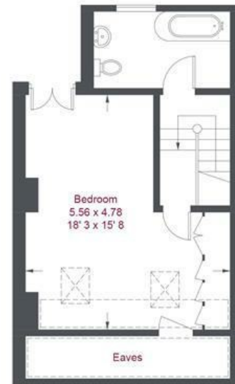
Second Floor 426 sq ft / 39.6 sq m (Including Reduced Headroom / Eaves)