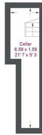
Basement 92 sq ft / 8.6 sq m