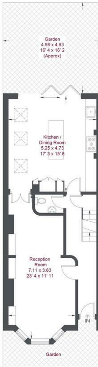
Ground Floor 671 sq ft / 62.3 sq m