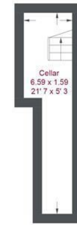
Basement 92 sq ft / 8.6 sq m