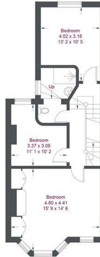
First Floor 579 sq ft / 53.8 sq m