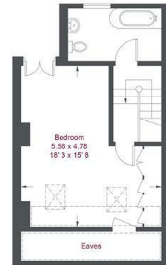
Second Floor 426 sq ft / 39.6 sq m (Including Reduced Headroom / Eaves)