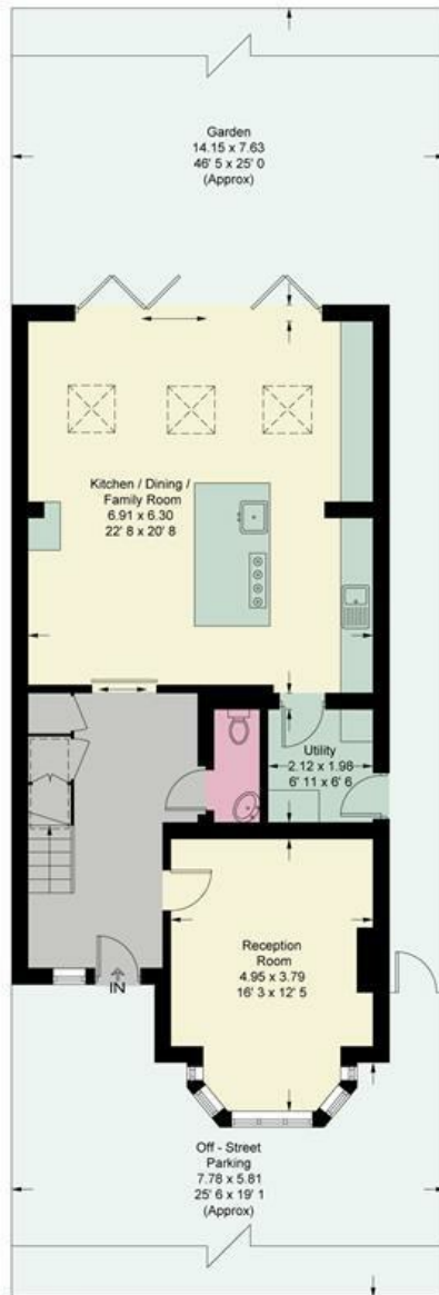
Ground Floor 926 sq ft / 86 sq m (Including Reduced Headroom)