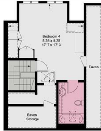
Second Floor 557 sq ft / 51.8 sq m (Including Reduced Headroom / Eaves Storage)