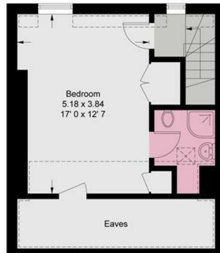
Second Floor 426 sq ft / 39.6 sq m (Including Reduced Headroom / Eaves)

This plan is not to scale and must be used as layout guidance only. All measurements and areas are approximate and should not be relied upon to provide accurate information. This plan must not be relied upon when making property valuations, design considerations or any other such relevant decisions. We accept no responsibility or liability (whether in contract, tort or otherwise) in relation to any loss whatsoever arising from or in connection with any use of this plan or the adequacy, accuracy or completeness of it or any information within it.