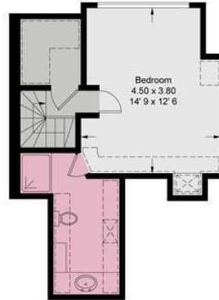
Second Floor 324 sq ft / 30.1 sq m (Including Reduced Headroom)