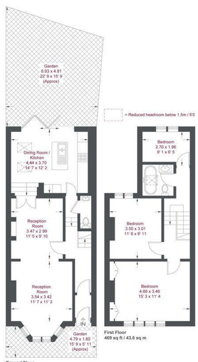
Ground Floor 562 sq ft / 52.2 sq m (Including Reduced Headroom)