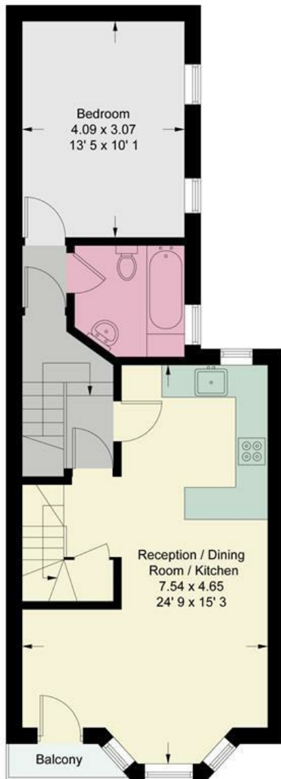
First Floor 573 sq ft / 53.2 sq m