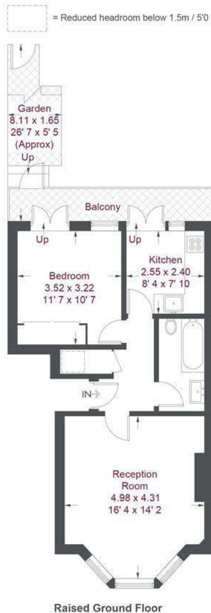
Raised Ground Floor