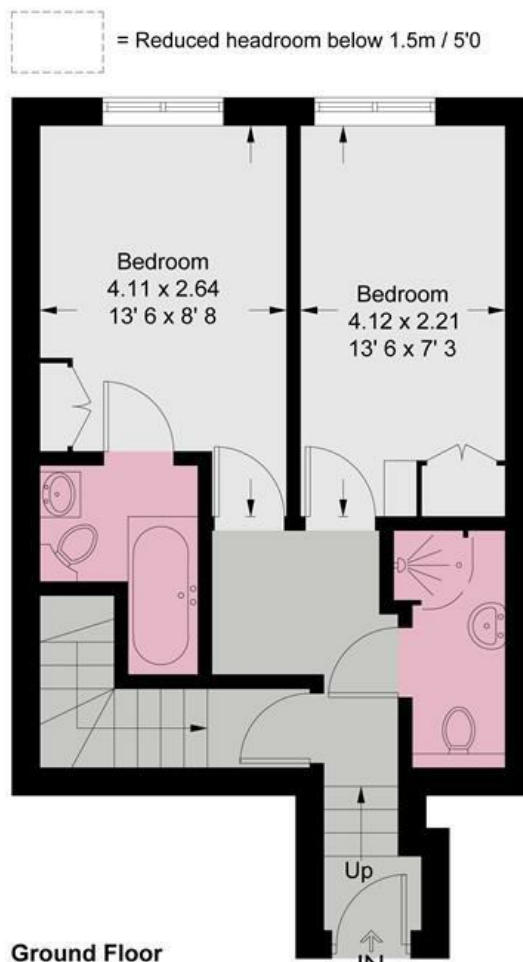
Ground Floor 390 sq ft / 36.2 sq m

This plan is not to scale and must be used as layout guidance only. All measurements and areas are approximate and should not be relied upon to provide accurate information. This plan must not be relied upon when making property valuations, design considerations or any other such relevant decisions. We accept no responsibility or liability (whether in contract, tort or otherwise) in relation to any loss whatsoever arising from or in connection with any use of this plan or the adequacy, accuracy or completeness of it or any information within it.