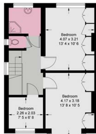
First Floor 486 sq ft / 45.2 sq m

This plan is not to scale and must be used as layout guidance only. All measurements and areas are approximate and should not be relied upon to provide accurate information. This plan must not be relied upon when making property valuations, design considerations or any other such relevant decisions. We accept no responsibility or liability (whether in contract, tort or otherwise) in relation to any loss whatsoever arising from or in connection with any use of this plan or the adequacy, accuracy or completeness of it or any information within it.