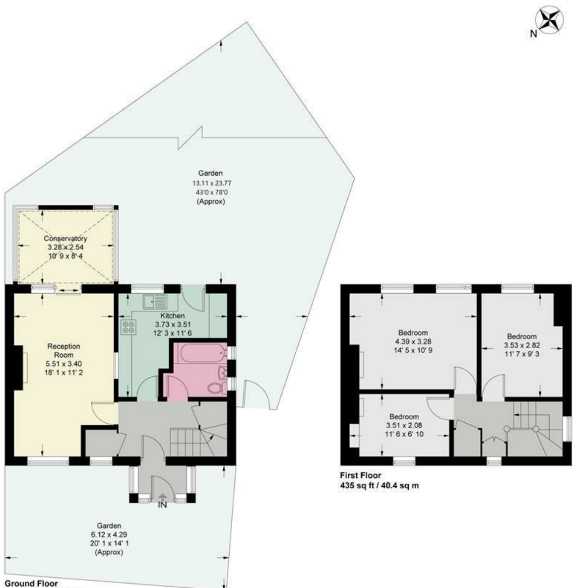
561 sq ft / 52.1 sq m

This plan is not to scale and must be used as layout guidance only. All measurements and areas are approximate and should not be relied upon to provide accurate information. This plan must not be relied upon when making property valuations, design considerations or any other such relevant decisions. We accept no responsibility or liability (whether in contract, tort or otherwise) in relation to any loss whatsoever arising from or in connection with any use of this plan or the adequacy, accuracy or completeness of it or any information within it.