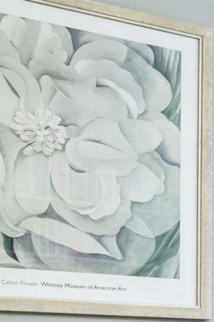
Calico Flower Whitney Museum of American Art