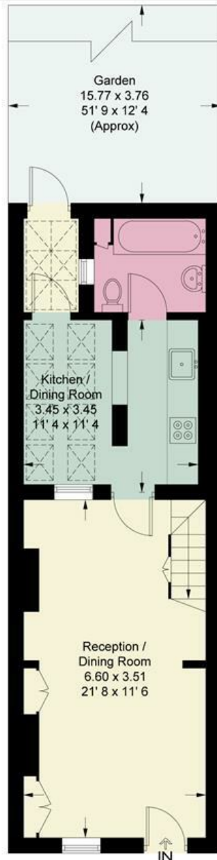
Ground Floor 471 sq ft / 43.8 sq m