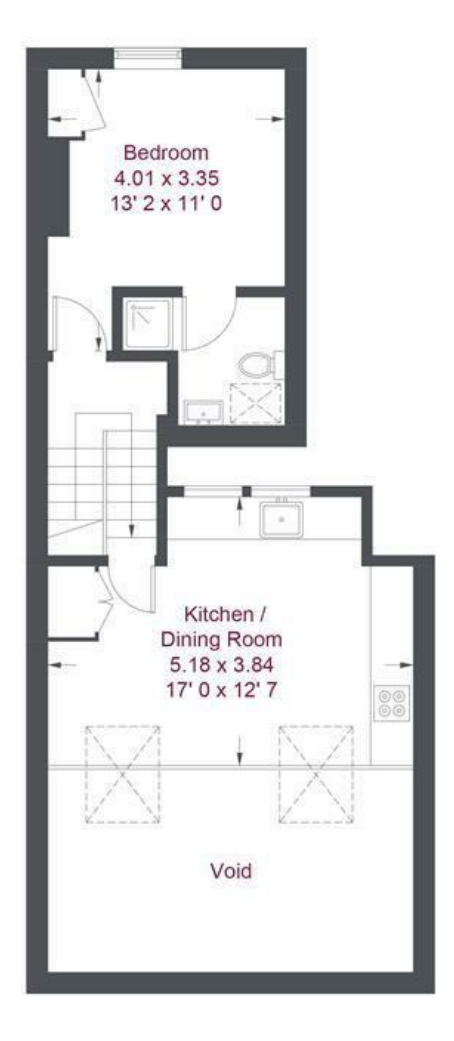
Second Floor 409 sq ft / 38 sq m (Excluding Void)