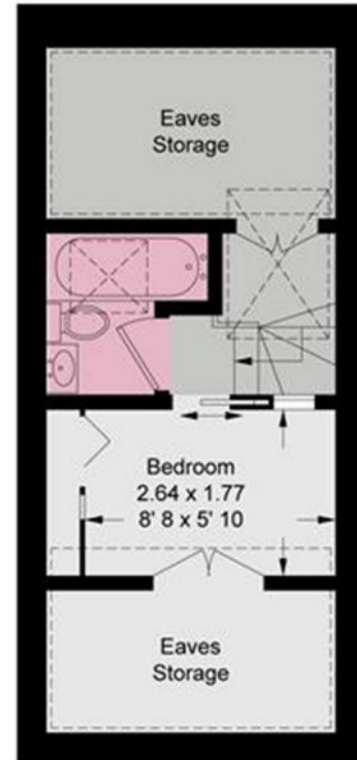
Second Floor 222 sq ft / 20.6 sq m (Including Reduced Headroom / Eaves Storage)