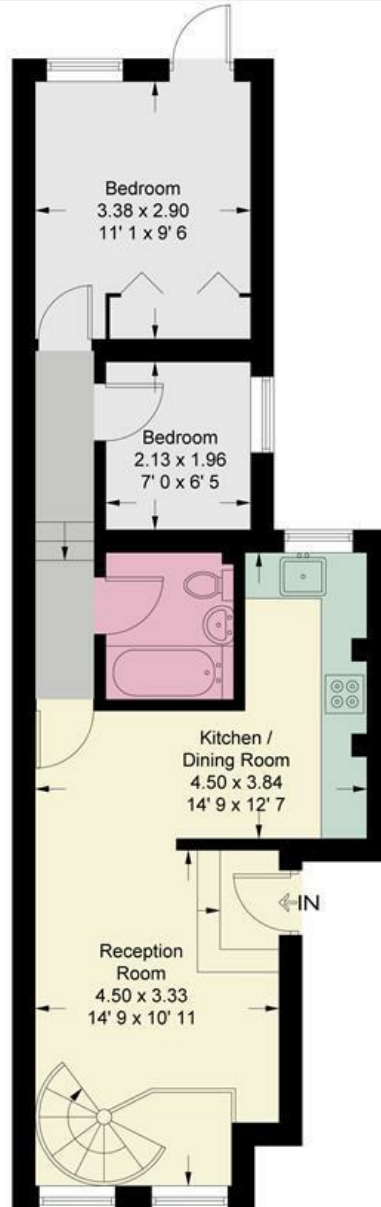
Ground Floor 515 sq ft / 47.9 sq m (Excluding Void)

This plan is not to scale and must be used as layout guidance only. All measurements and areas are approximate and should not be relied upon to provide accurate information. This plan must not be relied upon when making property valuations, design considerations or any other such relevant decisions. We accept no responsibility or liability (whether in contract, tort or otherwise) in relation to any loss whatsoever arising from or in connection with any use of this plan or the adequacy, accuracy or completeness of it or any information within it.