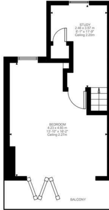
THIRD FLOOR 292 SQ.FT / 27.11 SQ.M