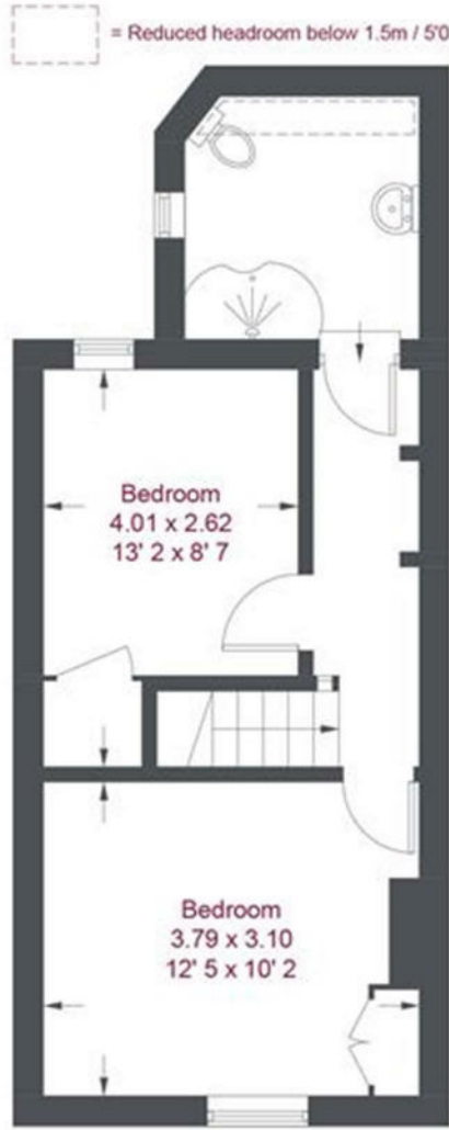
First Floor 366 sq ft / 34 sq m (Including Reduced Headroom)