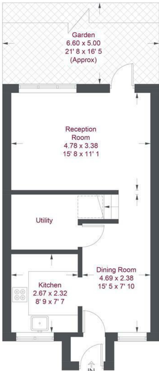
Ground Floor 456 sq ft / 42.4 sq m (Including Reduced Headroom)