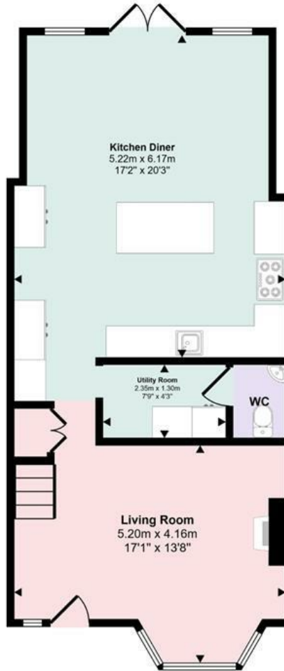
Ground Floor Approx 58 sq m / 622 sq ft

Approx Gross Internal Area 131 sq m / 1415 sq ft