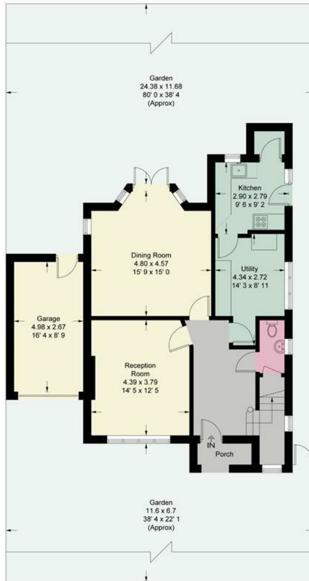
Ground Floor 791 sq ft / 73.5 sq m (Excluding Garage)