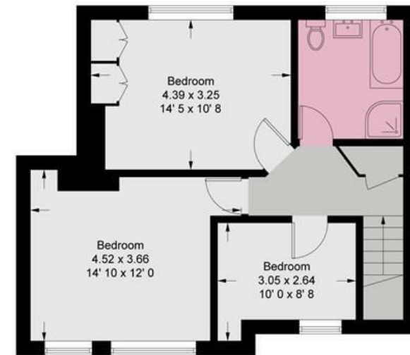
First Floor 533 sq ft / 49.5 sq m