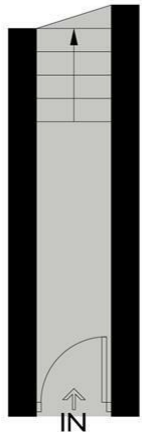
Ground Floor 35 sq ft / 3.3 sq m