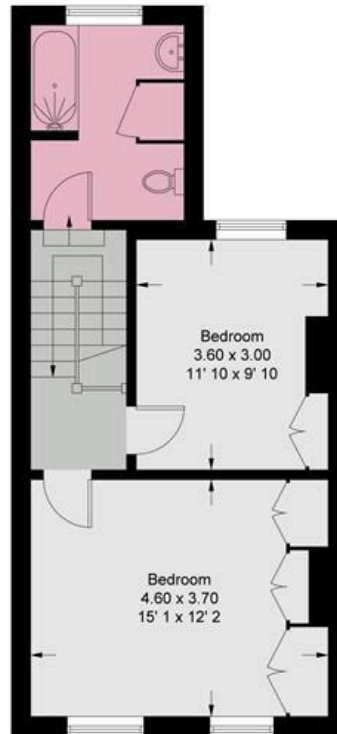
First Floor 460 sq ft / 42.7 sq m