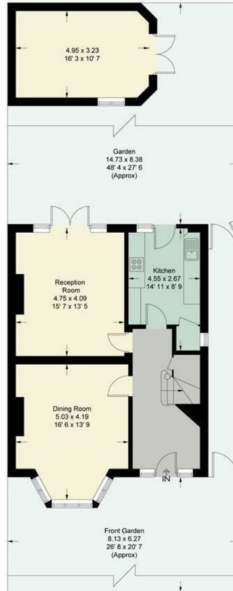
Ground Floor 681 sq ft / 63.3 sq m