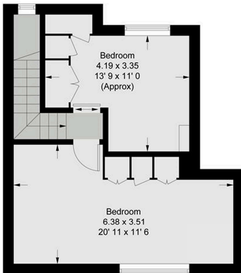
First Floor 411 sq ft / 38.2 sq m