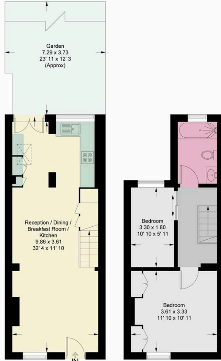
Ground Floor 381 sq ft / 35.4 sq m