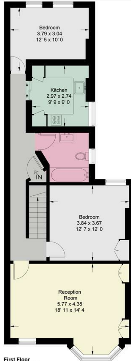
First Floor 822 sq ft / 76.4 sq m