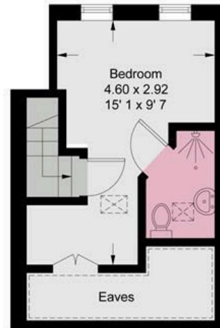
Second Floor 213 sq ft / 19.8 sq m (Including Reduced Headroom / Eaves)

This plan is not to scale and must be used as layout guidance only. All measurements and areas are approximate and should not be relied upon to provide accurate information. This plan must not be relied upon when making property valuations, design considerations or any other such relevant decisions. We accept no responsibility or liability (whether in contract, tort or otherwise) in relation to any loss whatsoever arising from or in connection with any use of this plan or the adequacy, accuracy or completeness of it or any information within it.