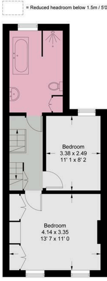
First Floor 414 sq ft / 38.5 sq m