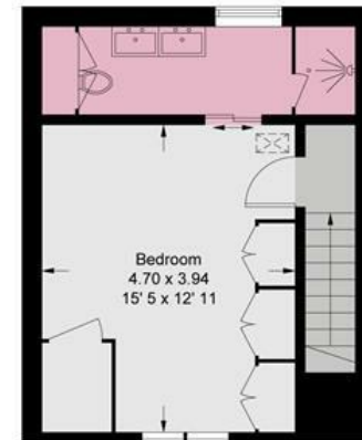
Second Floor 309 sq ft / 28.7 sq m