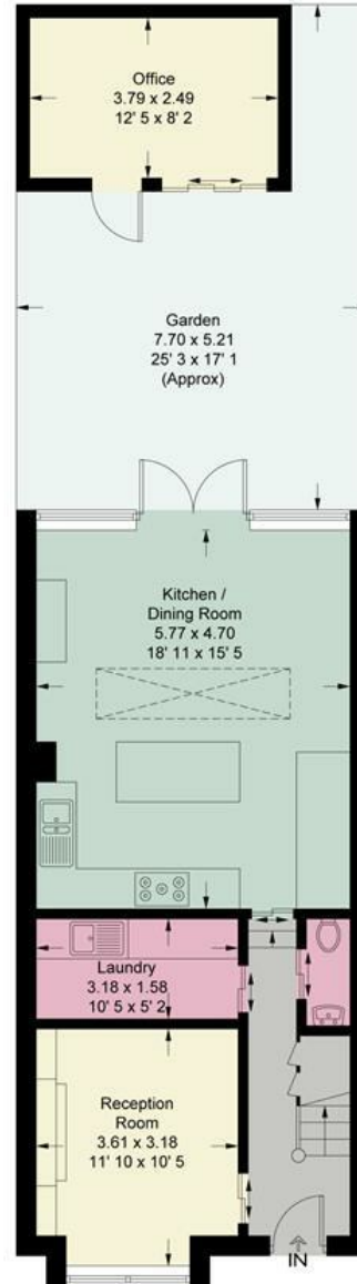
Ground Floor 566 sq ft / 52.6 sq m

020 8788 6611 sales@japutney.co.uk www.jamesanderson.co.uk