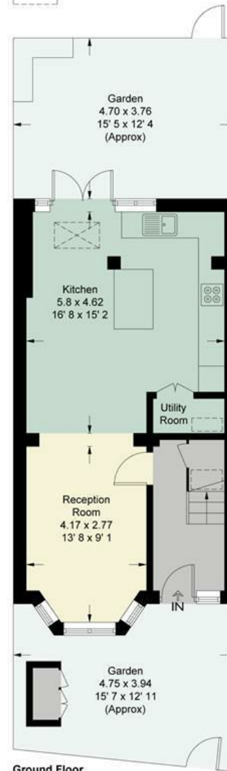
Ground Floor 462 sq ft / 42.9 sq m (Including Reduced Headroom)