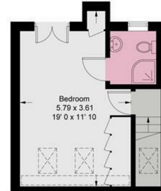
Second Floor 262 sq ft / 24.3 sq m (Including Reduced Headroom)