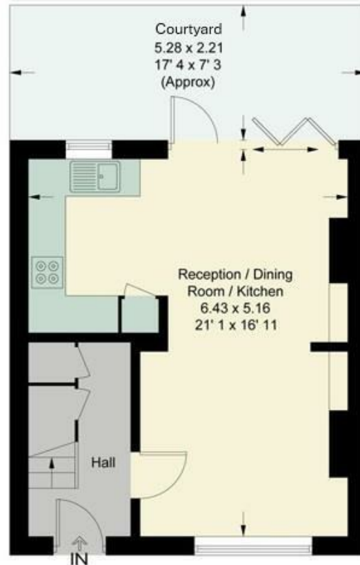
Ground Floor 354 sq ft / 32.9 sq m