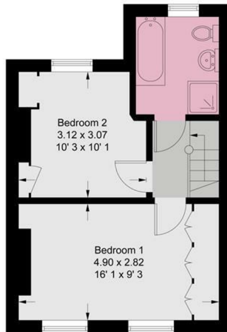
First Floor 348 sq ft / 32.3 sq m

This plan is not to scale and must be used as layout guidance only. All measurements and areas are approximate and should not be relied upon to provide accurate information. This plan must not be relied upon when making property valuations, design considerations or any other such relevant decisions. We accept no responsibility or liability (whether in contract, tort or otherwise) in relation to any loss whatsoever arising from or in connection with any use of this plan or the adequacy, accuracy or completeness of it or any information within it.