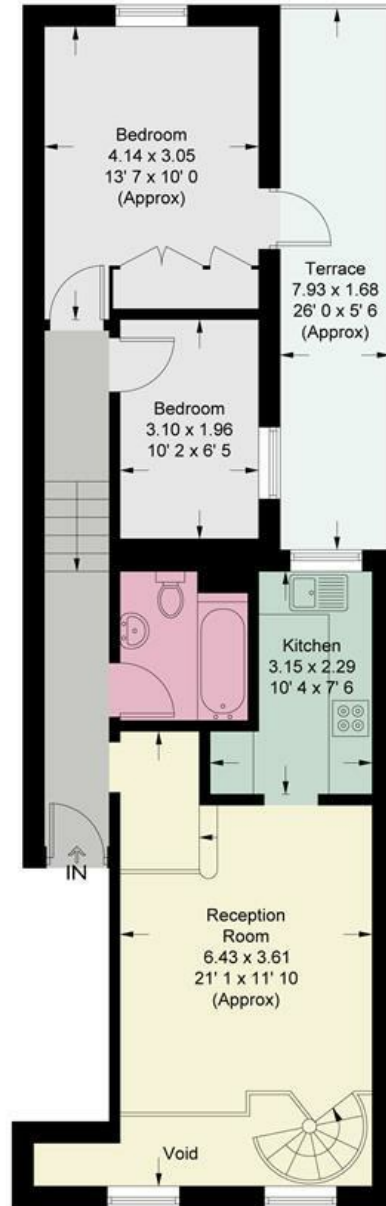
Ground Floor 598 sq ft / 55.6 sq m (Excluding Void)

This plan is not to scale and must be used as layout guidance only. All measurements and areas are approximate and should not be relied upon to provide accurate information. This plan must not be relied upon when making property valuations, design considerations or any other such relevant decisions. We accept no responsibility or liability (whether in contract, tort or otherwise) in relation to any loss whatsoever arising from or in connection with any use of this plan or the adequacy, accuracy or completeness of it or any information within it.