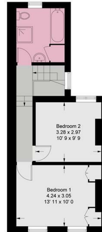
First Floor 393 sq ft / 36.5 sq m