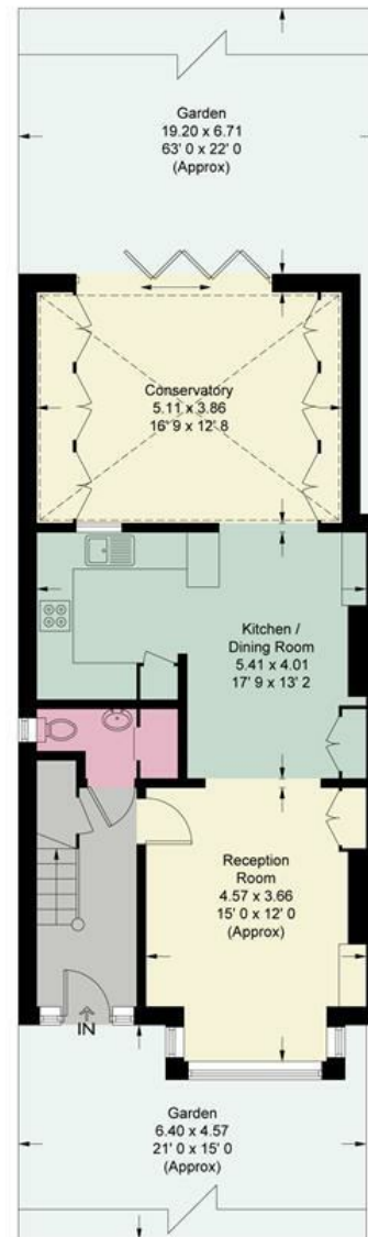
Ground Floor 721 sq ft / 67 sq m