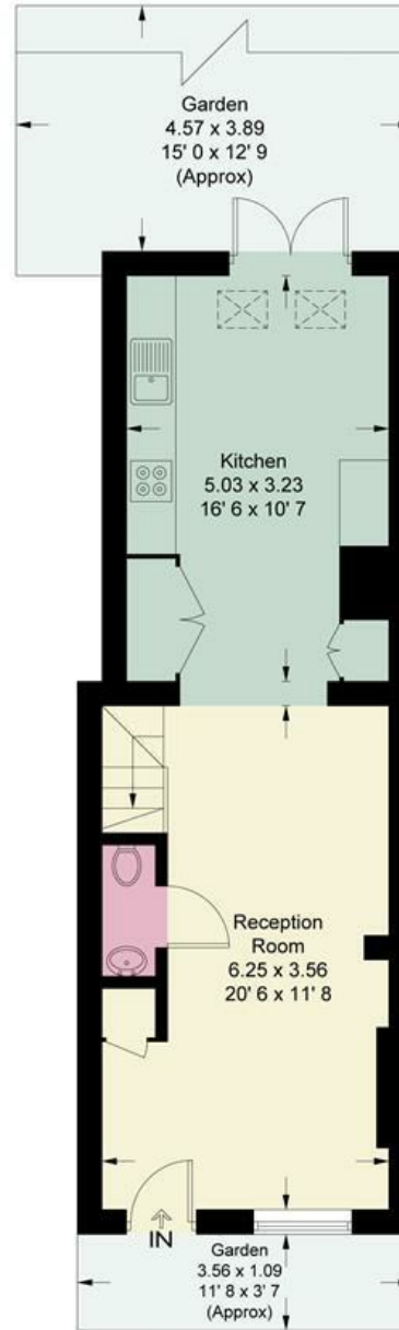
Ground Floor 430 sq ft / 40 sq m