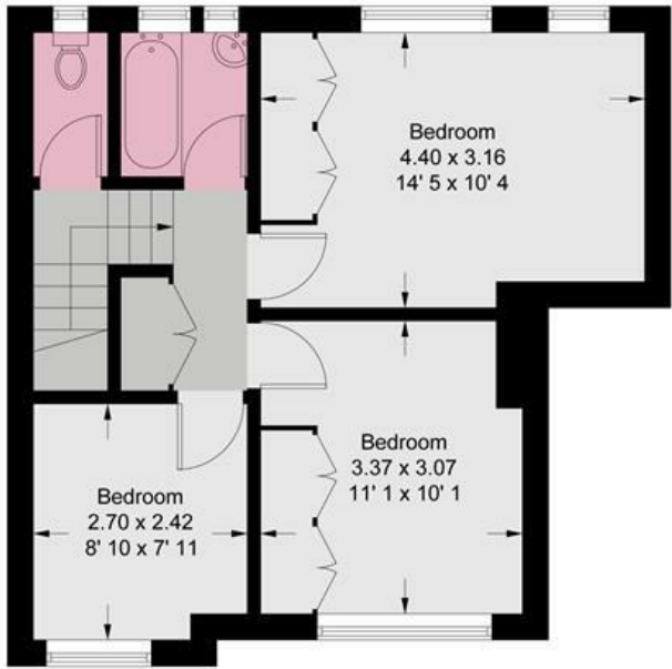
First Floor 444 sq ft / 41.3 sq m

This plan is not to scale and must be used as layout guidance only. All measurements and areas are approximate and should not be relied upon to provide accurate information. This plan must not be relied upon when making property valuations, design considerations or any other such relevant decisions. We accept no responsibility or liability (whether in contract, tort or otherwise) in relation to any loss whatsoever arising from or in connection with any use of this plan or the adequacy, accuracy or completeness of it or any information within it.