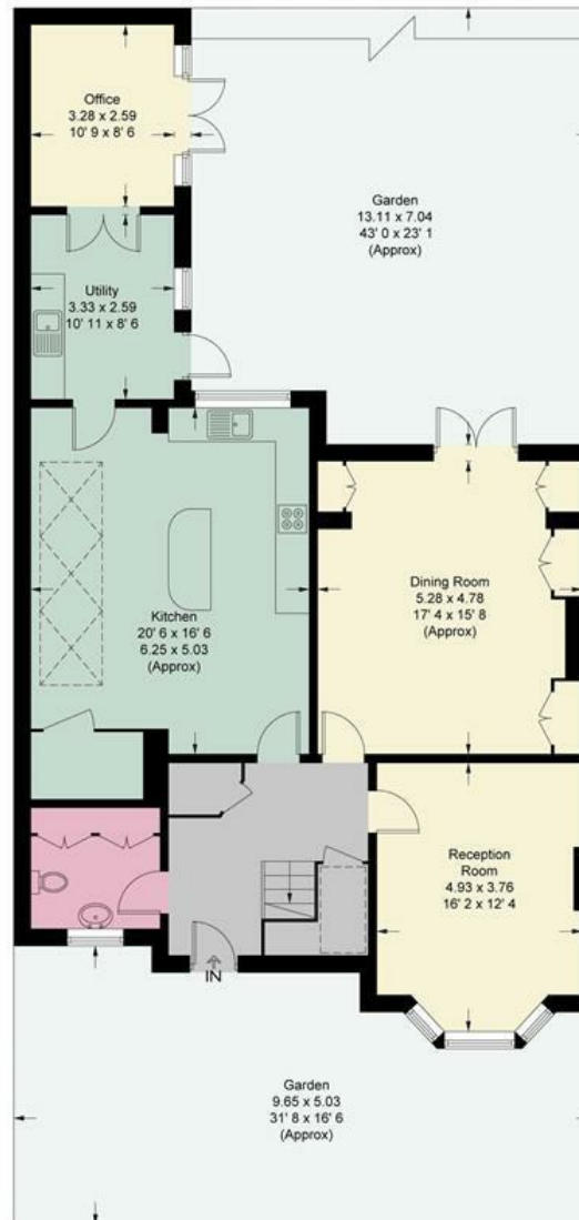
Ground Floor 1237 sq ft / 114.9 sq m (Including Reduced Headroom)