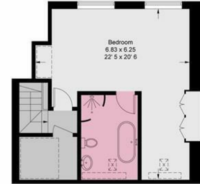
Second Floor 499 sq ft / 46.4 sq m (Including Reduced Headroom)