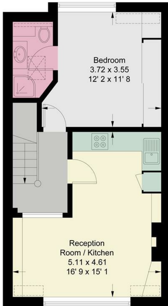
Second Floor 432 sq ft / 40.1 sq m (Including Reduced Headroom)

This plan is not to scale and must be used as layout guidance only. All measurements and areas are approximate and should not be relied upon to provide accurate information. This plan must not be relied upon when making property valuations, design considerations or any other such relevant decisions. We accept no responsibility or liability (whether in contract, tort or otherwise) in relation to any loss whatsoever arising from or in connection with any use of this plan or the adequacy, accuracy or completeness of it or any information within it.