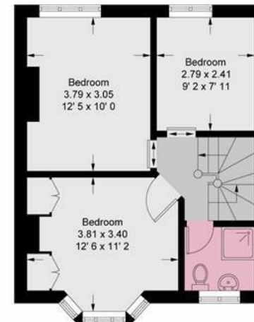
First Floor 415 sq ft / 38.6 sq m

This plan is not to scale and must be used as layout guidance only. All measurements and areas are approximate and should not be relied upon to provide accurate information. This plan must not be relied upon when making property valuations, design considerations or any other such relevant decisions. We accept no responsibility or liability (whether in contract, tort or otherwise) in relation to any loss whatsoever arising from or in connection with any use of this plan or the adequacy, accuracy or completeness of it or any information within it.