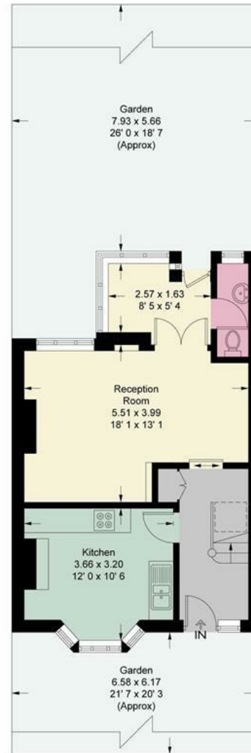
Ground Floor 494 sq ft / 45.9 sq m (Including Reduced Headroom)

020 8876 6611 sales@jasheen.co.uk www.jamesanderson.co.uk