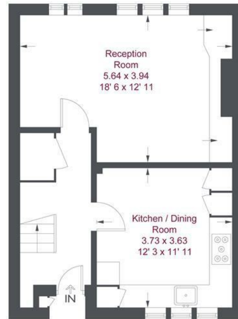
Second Floor 469 sq ft / 43.6 sq m