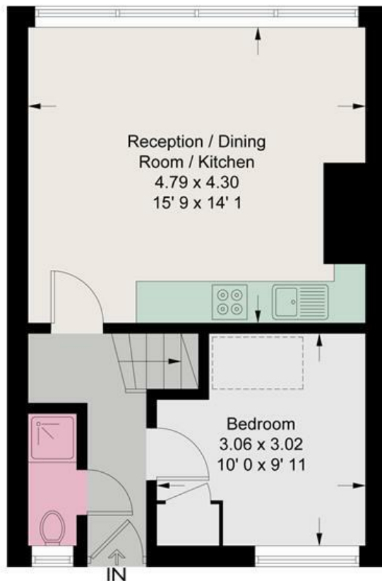
First Floor 390 sq ft / 36.3 sq m