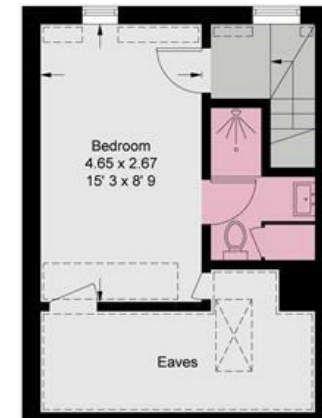
Second Floor 322 sq ft / 29.9 sq m (Including Reduced Headroom / Eaves)