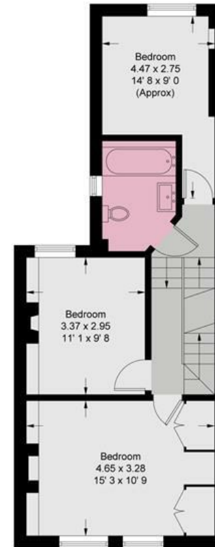
First Floor 511 sq ft / 47.5 sq m