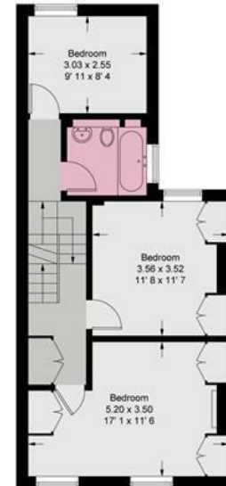
First Floor 547 sq ft / 50.8 sq m