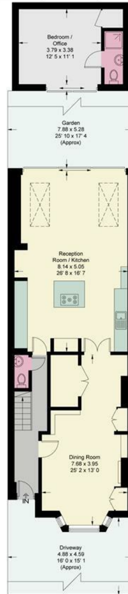
Ground Floor 843 sq ft / 78.3 sq m

020 8876 6611 sales@jasheen.co.uk www.jamesanderson.co.uk