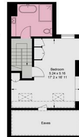
Second Floor 482 sq ft / 44.8 sq m (Including Reduced Headroom / Eaves)

This plan is not to scale and must be used as layout guidance only. All measurements and areas are approximate and should not be relied upon to provide accurate information. This plan must not be relied upon when making property valuations, design considerations or any other such relevant decisions. We accept no responsibility or liability (whether in contract, tort or otherwise) in relation to any loss whatsoever arising from or in connection with any use of this plan or the adequacy, accuracy or completeness of it or any information within it.